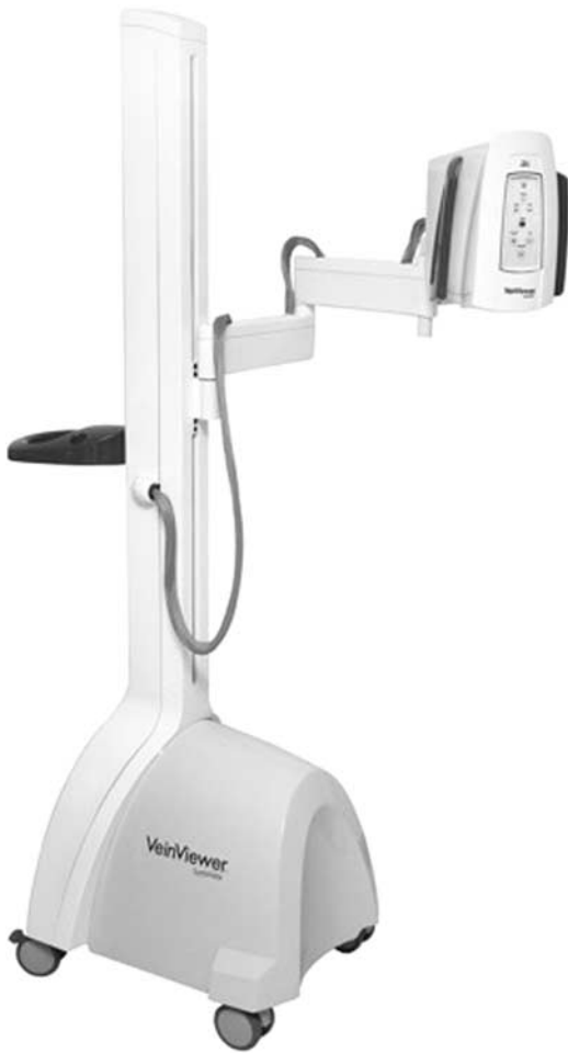
Figure 1 Vein Viewer imaging system.