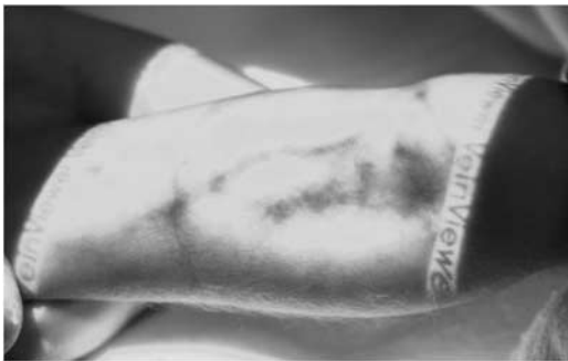
Figure 2 Vein Viewer image of a neonatal arm.

image, the Vein Viewer was calibrated before each use. It was then placed over the extremity of choice at a 90° angle; a near-infrared augmented image was obtained (Figure 3). 9