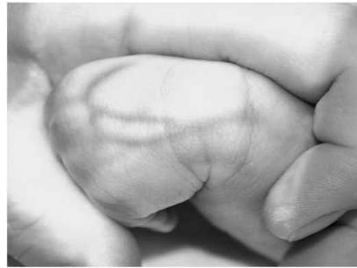
Figure 3 Vein Viewer image of a neonatal hand.

Other than the visualization technique used, all other aspects of placement were performed using institutional standards. Accordingly, all lines were placed by an expert level neonatal nurse practitioner/registered nurse PICC team, in-serviced by the manufacturer's representative on the use of the Vein Viewer. Infants in both groups had placement performed under sterile